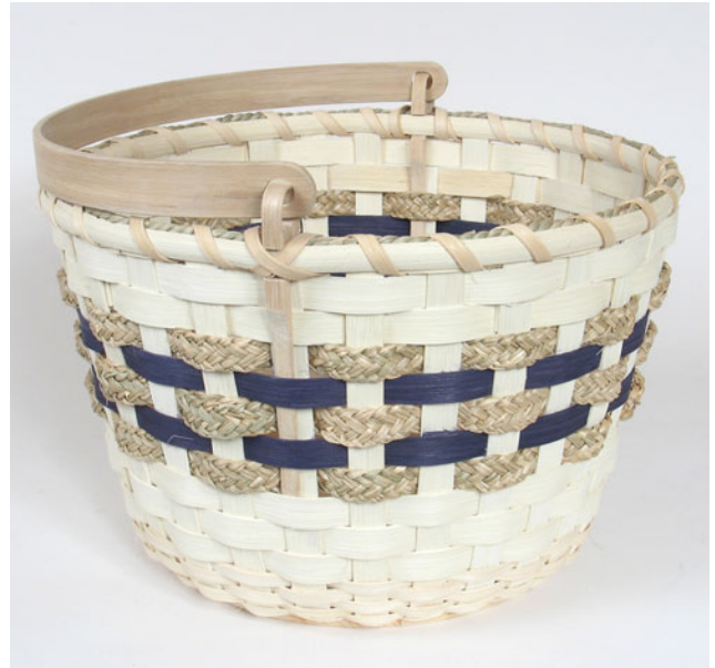
Size: 12" diameter (at rim); Height: 8"