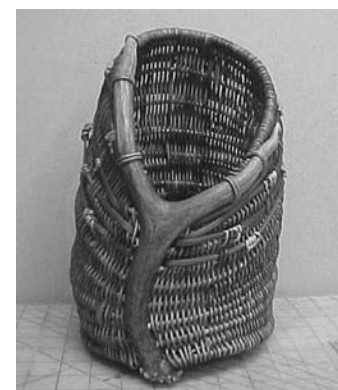
Skep - March 12, 2010

Class sizes are limited. Call today to register 1-800-447-7008